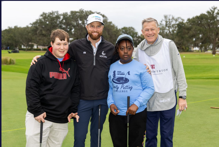
Charity Putting Challenge

In the first 14 years of the event, The RSM Classic has raised and distributed more than $41 million in charitable funds to local, regional, and national charities.