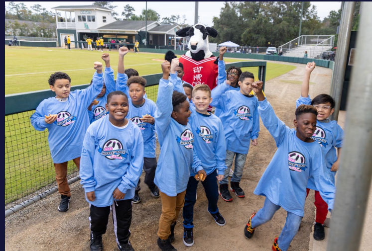
PGA TOUR Wives Wiffle Ball Classic