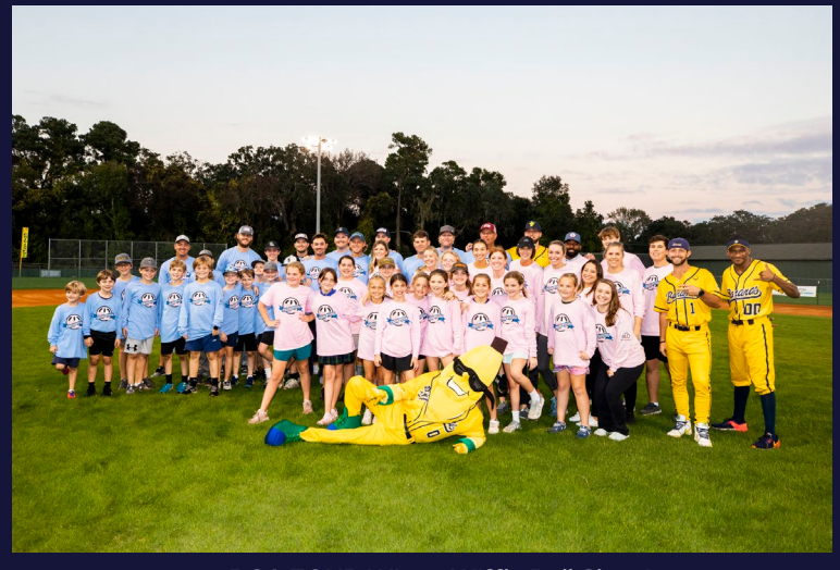
PGA TOUR Wives Wiffle Ball Classic