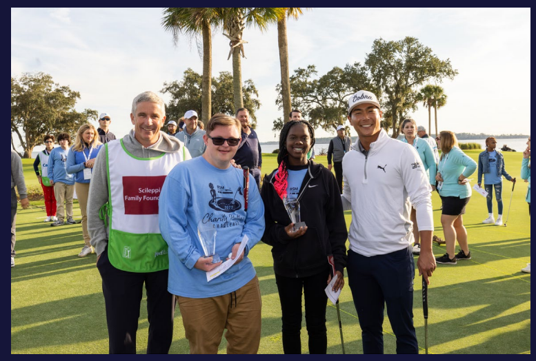
Charity Putting Challenge

In the first 13 years of the event, The RSM Classic has raised and distributed more than $35 million in charitable funds to local, regional, and national charities.