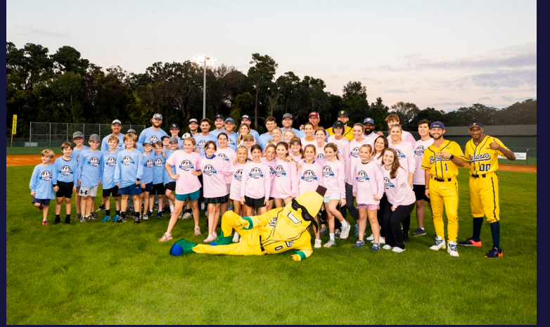
PGA TOUR Wives Wiffle Ball Classic