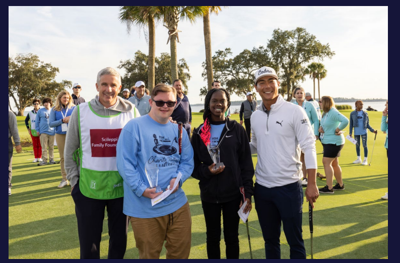
Charity Putting Challenge

In the first 13 years of the event, The RSM Classic has raised and distributed more than $35 million in charitable funds to local, regional, and national charities.